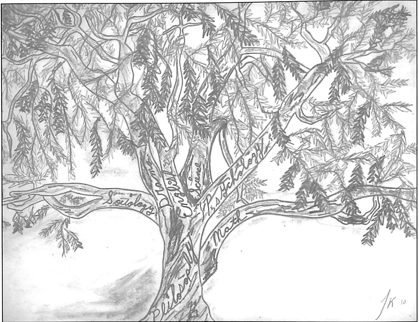
TREE OF ACADEMIA BY JOEL KJEARSGAARD