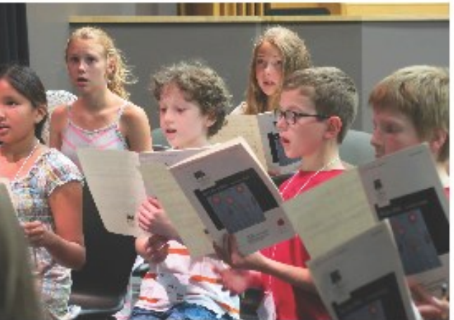
INSPIRATION FOR TEACHERS Attend workshops, observe rehearsals, receive music & repertoire suggestions, exchange ideas, sing! Undergrad/MUED/P.D. credit available singspiration.concordia.ab.ca/ inspiration-for-teachers/

ADULT SUMMER CHOIR Aug. 10 to 13, 7-9:30 p.m. Concert Fri. Aug. 14, 7:30 p.m.