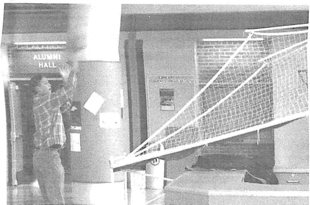
DC with one of the fun activities.