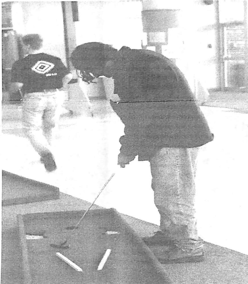
Putzing around in Tegner

***For more detailed information on Eastern European Opportunities, write to GLOBAL Employment Network, P.O. Box 45760, Seattle WA. 98145 - 0760. Or talk to Cathy at the B&W.