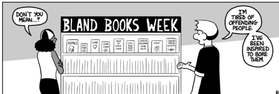
Unshelved® ©2008 Bill Barnes and Gene Ambaum http://www.unshelved.com/ Copyright © Overdue Media LLC Used with permission