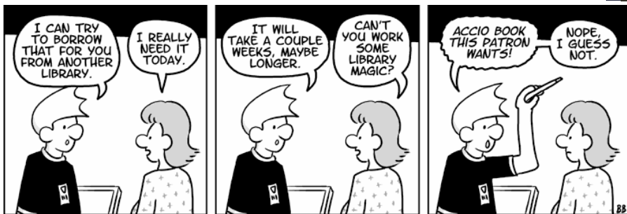
UNSHELVED by Gene Ambaum & Bill Barnes http://www.unshelved.com/ Copyright © Overdue Media LCC Used with permission