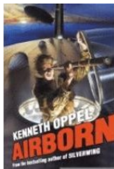
Airborn by Kenneth Oppel