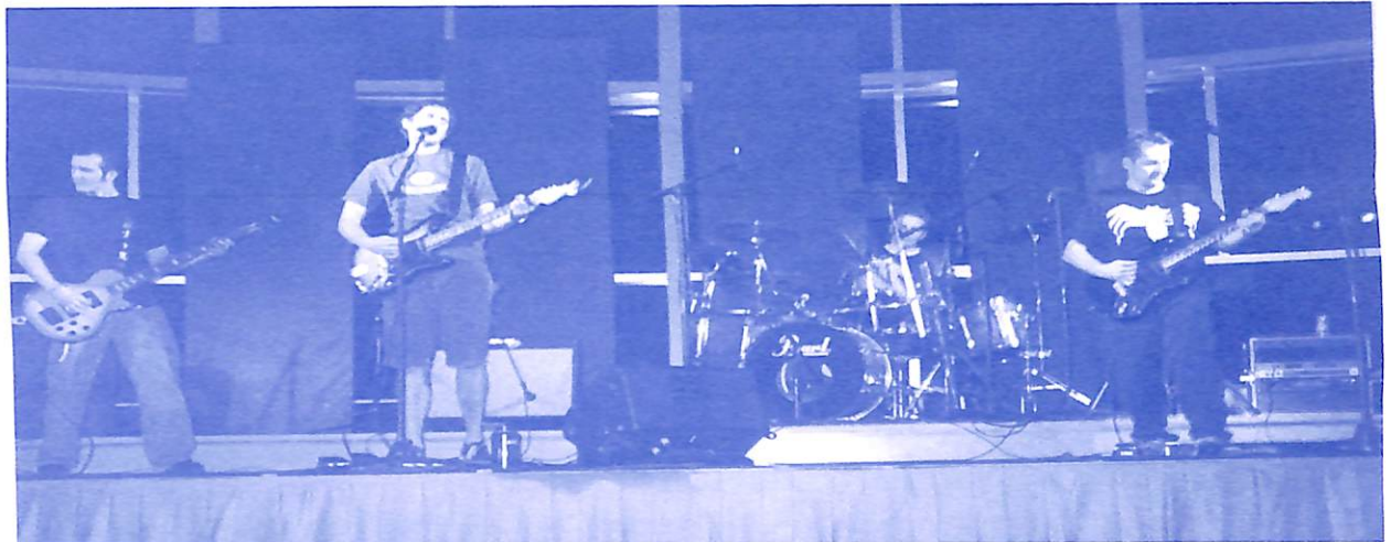
the band rocks