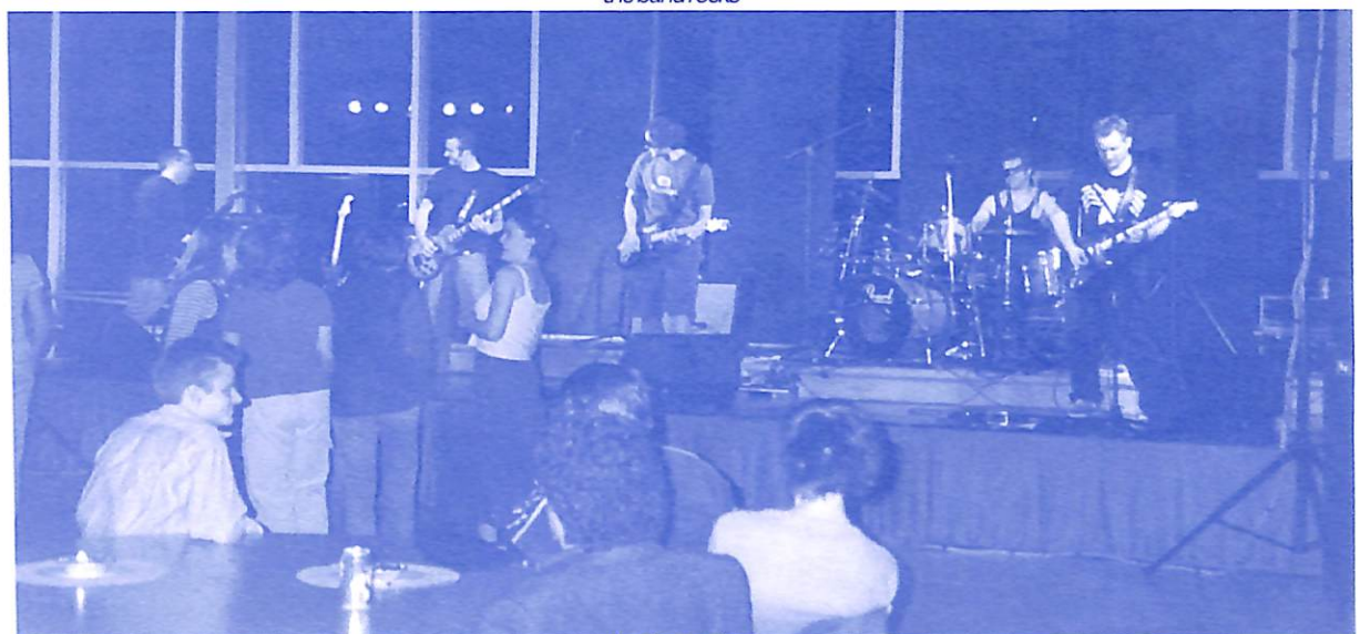
the fans rock