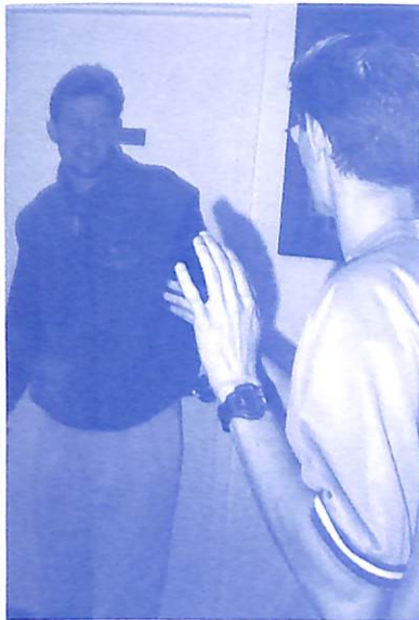
"Hey man, come into my office for an excellent adventure!" "No Dave, no! I've had enough of your excellent adventures!"