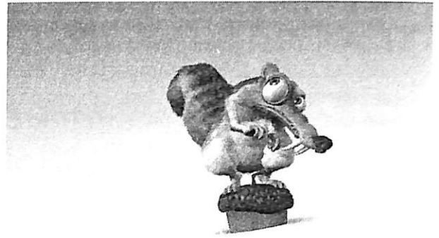
The Pre-historic Rat-squirrel (Scrat) with his acorn provides great slapstick and serves to segue-way scenes very nicely.

The other characters Siego the Sabertooth (Denis Leary) and the Pre-historic Rat-squirrel (Scrat) with his acorn provides great slapstick and serves to segue-way scenes very nicely and act as a bookend for the film. Bookends in film are at the start and finish and kind of tie them together, like the Feather in Forrest Gump (Robert Zemeckis) or the Texas Crossroads in Cast Away (Also Robert Zemeckis). Ice Age is a