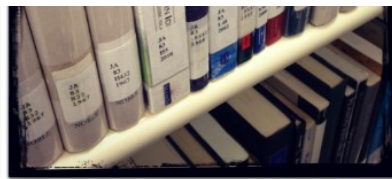
Finding books for my PSCI assignment - with Concordia Library