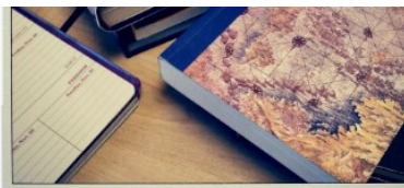
@CUCA_library catching up on this week's readings #neverending