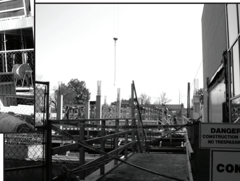
Construction now and then: August (left) and May (right)

is under construction. It's an exciting building, and it should be completed sometime in the second