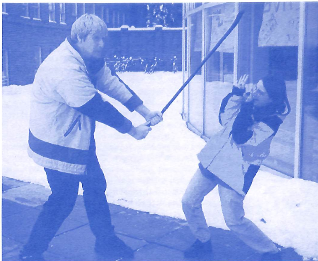
Give me your candy little girl! Just don't steal Christmas.

This issue has raised some concerns about student safety at