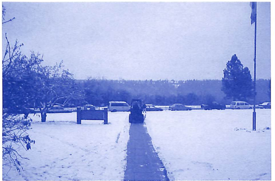
"Hey Lazer-lips, yo' mamma was a snowblower" - Short Circuit