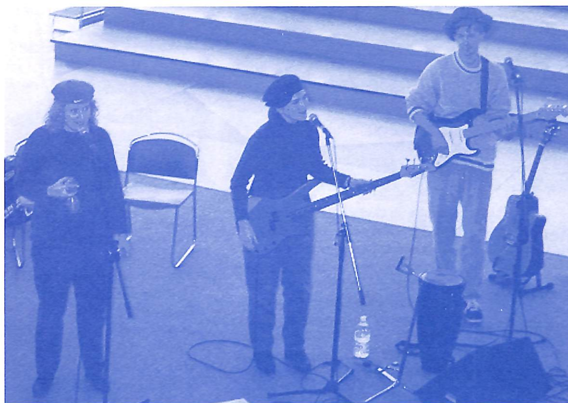
Christian Life week rocking the house in.

The gift of the Christ child was not commercial - quite the opposite, it was the only gift God had left to give man. The gifts given to the child were gifts, other than those from the wise men, that were special to those who gave them. Santa Claus started out giving only hand made gifts and now he seems to give whatever the child's parents could afford, or not afford if they put it on credit cards. Santa Claus is out there, in each one of us, and it is up to us to find him and bring him out. Make this the season to see Santa Claus every where, in the stores, in your homes, and in your hearts. Yes, Virginia, there is a Santa Claus.