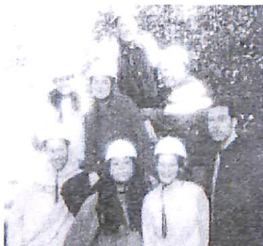
CSA Members on their retreat, Sept 9-10

In one of the sessions over the weekend, I gave a small presentation to the council members about The Blue & White and about the goals we have for this year's paper. I encouraged them to use the newspaper to communicate with you, the students. If you don't see this happening over the next year, take it up with your council members; you deserve to be informed!